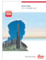
Leica Viva Overview brochure

Illustrations, descriptions and technical data are not binding. All rights reserved. Printed in Switzerland – Copyright Leica Geosystems AG, Heerbrugg, Switzerland, 2012. 804855en-us – 01.14 – galledia