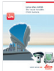
Leica Viva GNSS Product brochure