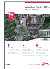
Leica Zeno Field & Office