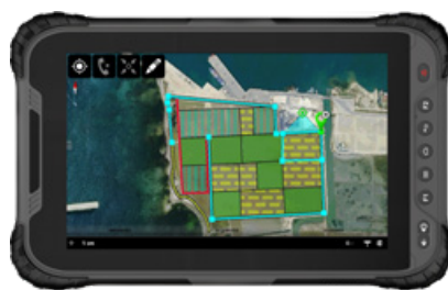
ZENO TAB 2