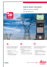
Leica Zeno Connect