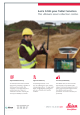
Leica GG04 plus Tablet Solution

Microsoft, Windows® and the Windows logo are either registered trademarks or trademarks of Microsoft Corporation in the United States and / or other countries.